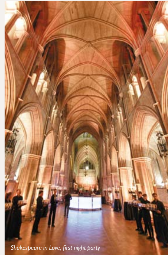
Shakespeare in Love, first night party