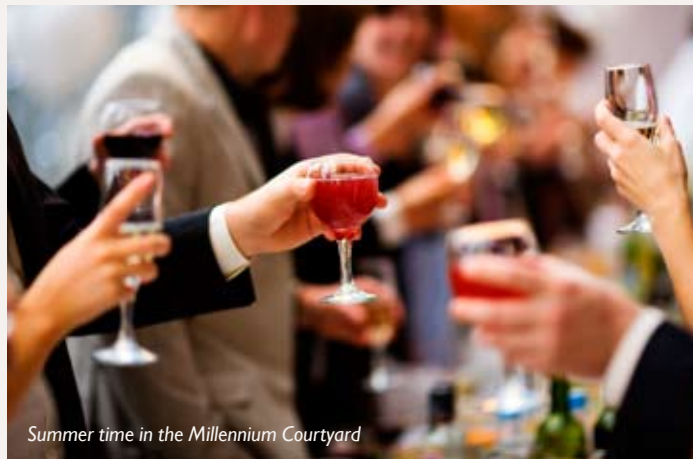
Summer time in the Millennium Courtyard

Our prestigious location is exceptionally suited to staging meetings, business gatherings, work conference and business events. Ample space, equipped with all the comforts and functionality required to exceptionally welcome and spoil your delegates.