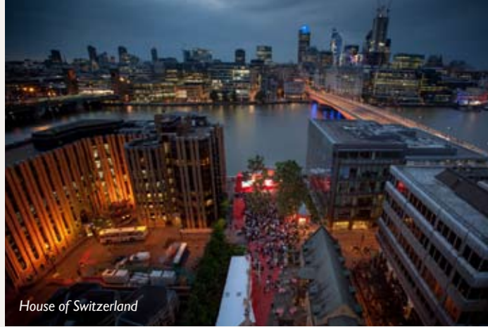
House of Switzerland