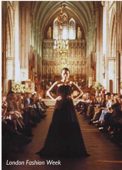
London Fashion Week