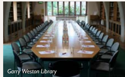
Garry Weston Library

Southwark Cathedral and its catering partner, Azure, look forward to offering you the best in corporate and event hospitality together with the personal attention to detail that is so appreciated by our clients.